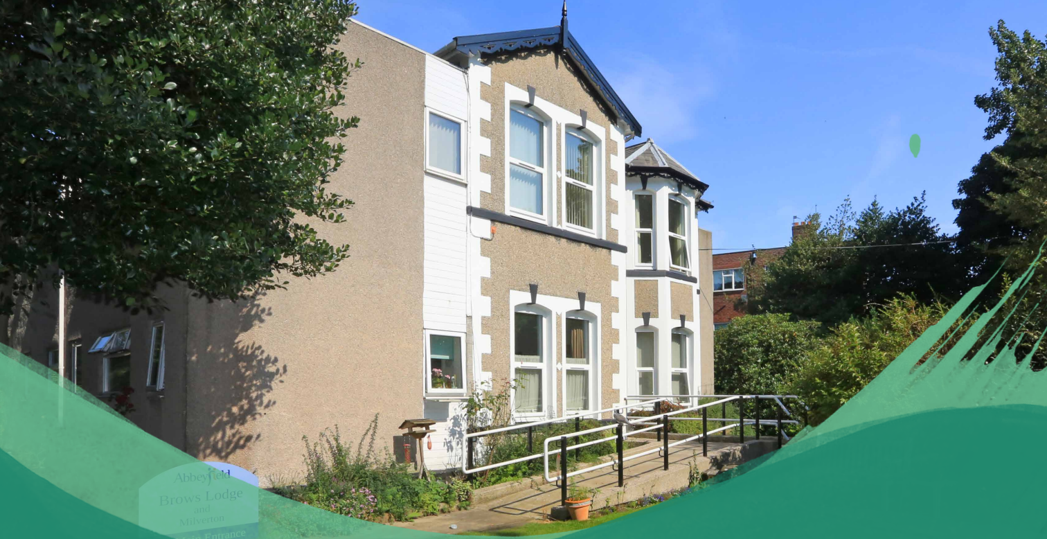
Abbeyfield Brows Lodge and Milverton Main Entrance